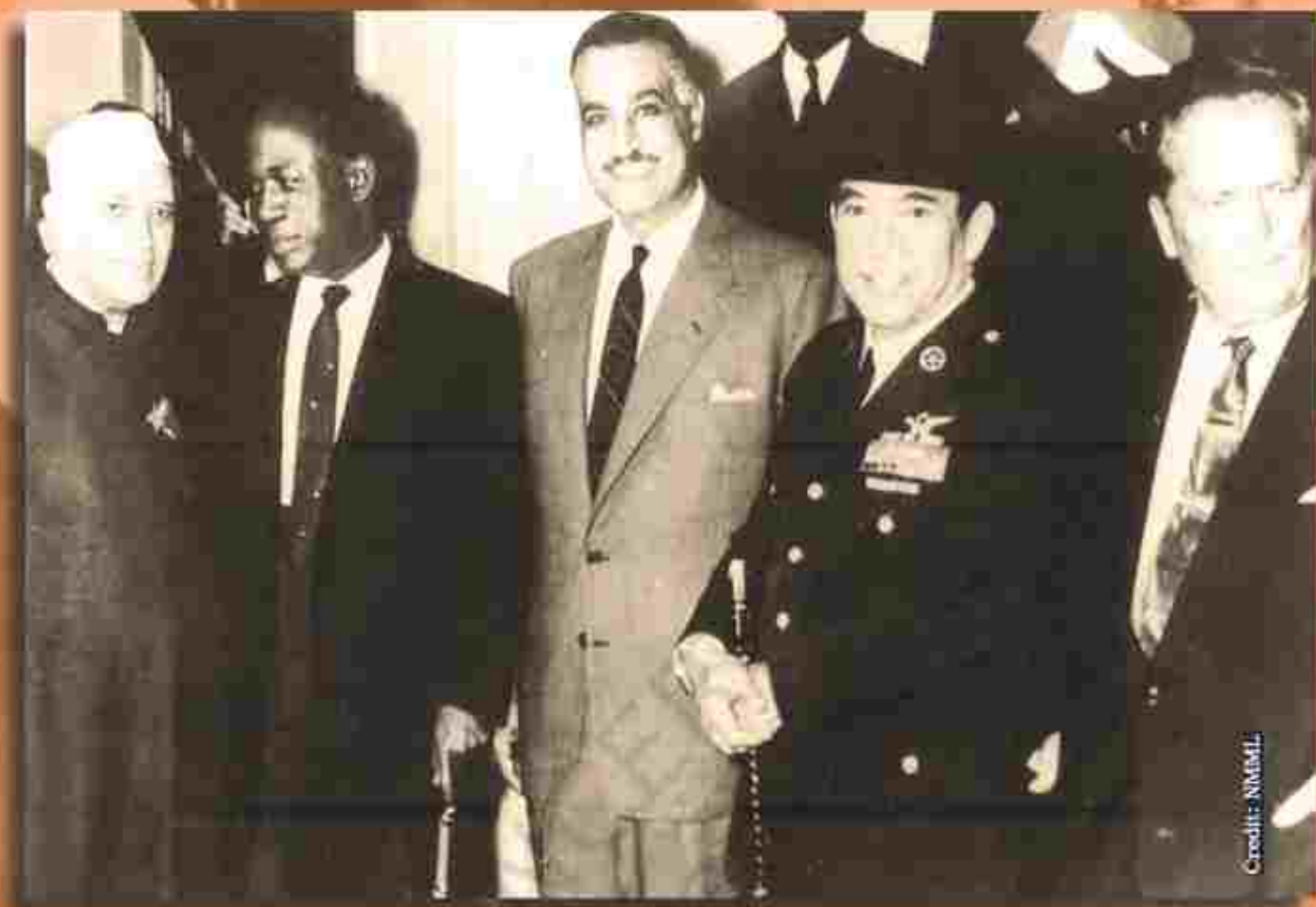
Nehru with Nkrumah from Ghana, Nasser from Egypt, Sukarno from Indonesia and Tito from Yugoslavia at a meeting of non-aligned nations, New York, October 1960. These five comprised the core leadership of the Non-Aligned Movement (NAM).